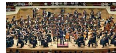
The Yomiuri Nippon Symphony Orchestra

The Yomiuri Nippon Symphony Orchestra was established in 1962 as the world's only orchestra owned by a newspaper company. The Yomiuri Shimbun participates in a wide range of entertainment fields such as by organizing the 1966 Beatles concert in Japan.