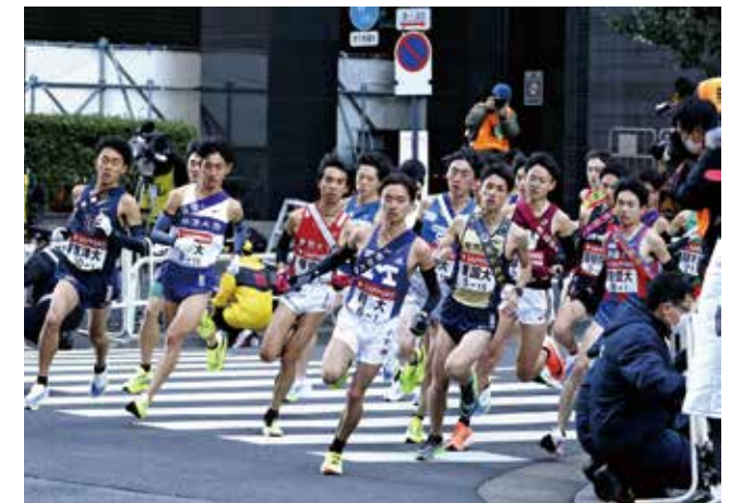
(Top) Athletes begin the race in unison for the Hakone Ekiden race in front of the Yomiuri Shimbun Building (in Chiyoda Ward, Tokyo, January 2021)

The Yomiuri Shimbun conveys the wonders of sports by organizing the professional baseball games of the Giants, the Hakone Ekiden race (round-trip university relay race between Tokyo and Hakone), and the All Japan University Women's Ekiden race. We are also actively involved in student sports such as by sponsoring the JFA U-12 Japan Football Championship and cosponsoring the Inter-High School Championships.