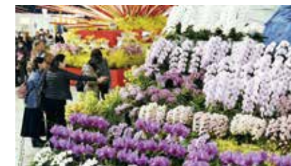
Venue of the Japan Grand Prix International Orchid and Flower Show 2020 (in Bunkyo Ward, Tokyo, in February 2020)

We have also launched other events such as the Japan Grand Prix International Orchid and Flower Show, one of the world's largest orchid festival, as well as the Yomiuri Shoho Exhibition, one of Japan's largest public exhibition of traditional calligraphy based on the classics.