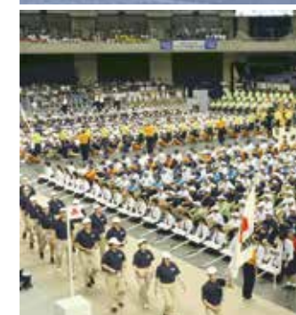
(Left) The general opening ceremony of the inter-high school championship (in Kagoshima, July 2019)