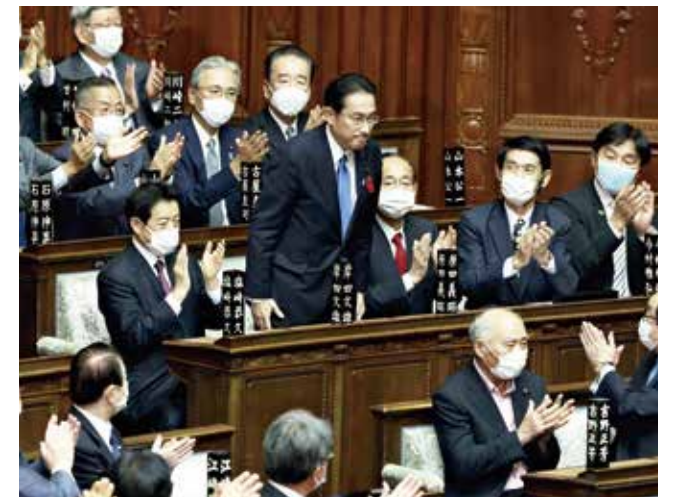
Mr. Kishida bows as he is nominated for prime minister at a plenary session of the House of Representatives (at the Diet in October 2021)

When publishing important articles such as investigative or special reports, our fair reporting committee comprised of experienced reporters pre-validate the appropriateness of the article content from third-party perspectives. The committee interviews the reporters and management desks regarding the background information and details of the investigations and verifies whether the articles are well supported and the facts were legitimately evaluated based on the investigation.