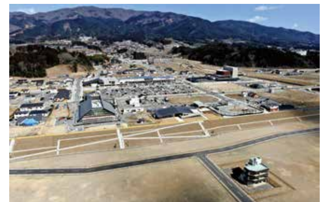
In Rikuzentakata, Iwate Prefecture, where the center of the city was devastated by the tsunami, a new urban area created by a large-scale raising project spreads throughout the region (March 2021)