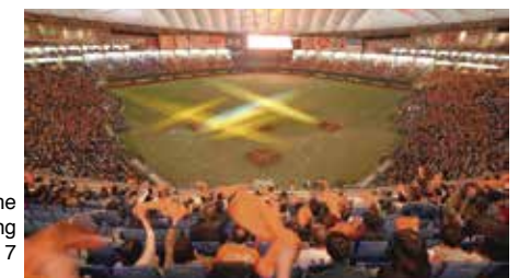
Image of Tokyo Dome - Tokyo Dome bathing in orange at a 2017 ceremony